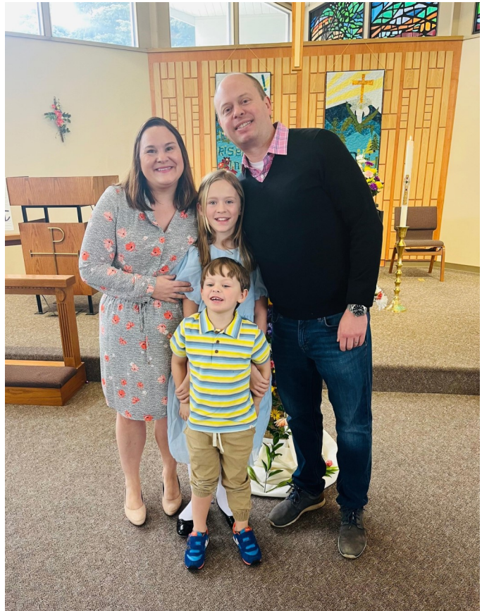
He is Risen indeed! Alleluia!