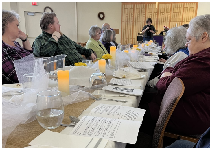
Maundy Thursday meal and service

No More Deaths: A Remembrance Vigil on March 30 at First United Methodist Church with Christians for Equality.