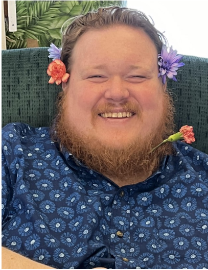
He is Risen!